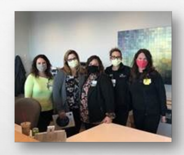
Photo featured in the "What You Need to Know Today - January 20, 2021" Banner Email Newsletter